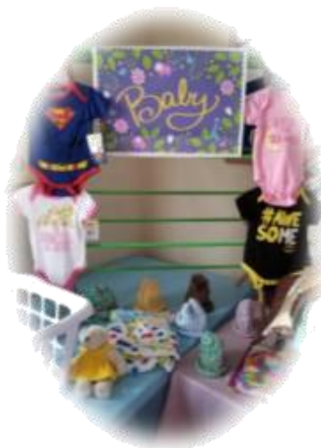
Pregnancy Center Baby Shower