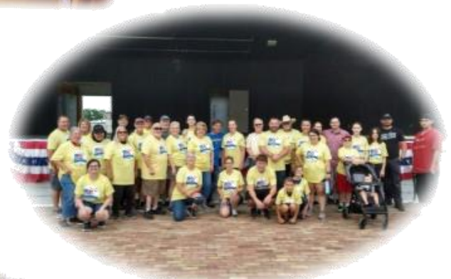
4th of July Volunteers