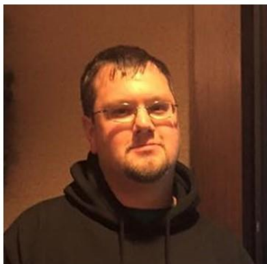
Audio Visual Technician