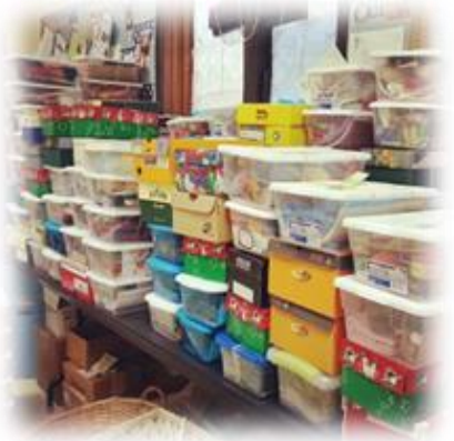
Operation Christmas Child