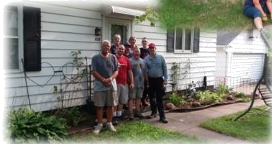
Community Yard Work