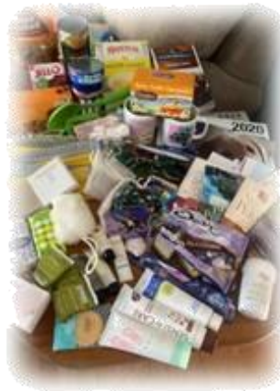
Women's Shelter Mother's Day Baskets