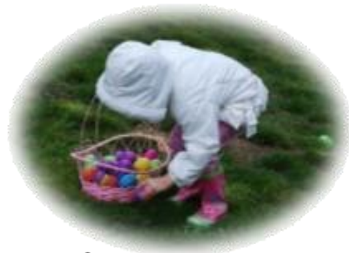
Annual Easter Egg Hunt