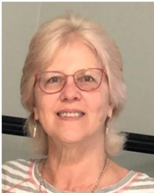
Director Children's Ministries