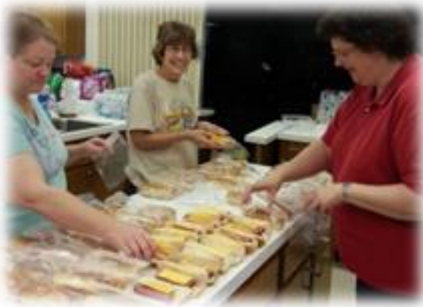
Brown Bag Ministries

We are a financially healthy congregation with no debt or outstanding loans. This allows us the freedom to do more for our members and the community by hosting special ministry related events and programs. This includes programs such as Men's and Women's Ministry, Sonshine Kids, Youth Group, Brown Bag Ministries, and Kids Outdoor Zone (KOZ):